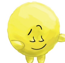
SEPASS GOZAR SHOKR GOZAR